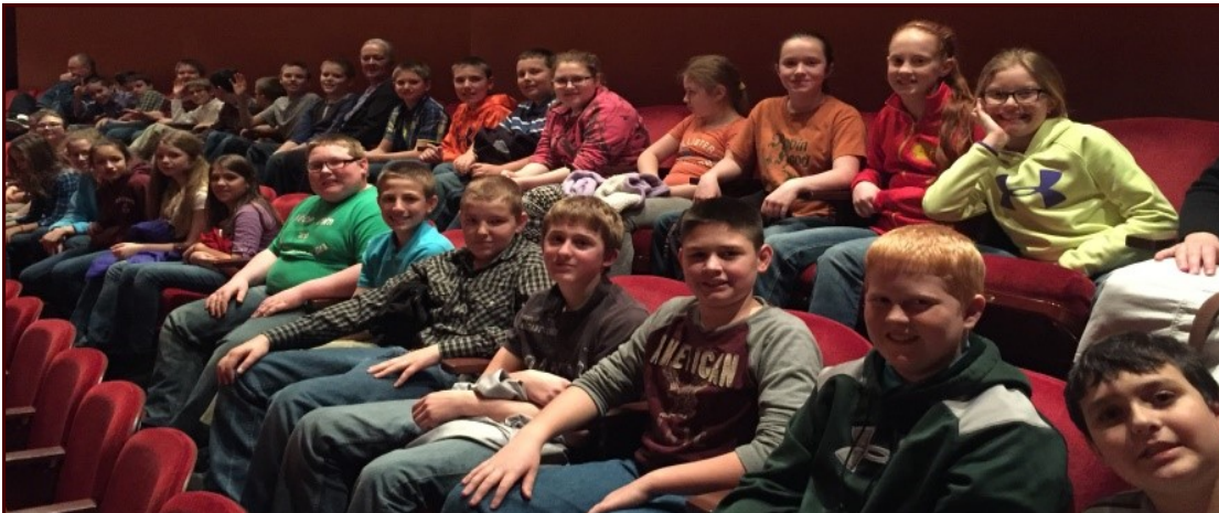
Sterling 5 th & 6 th grade students attended the Lincoln Symphony Orchestra's concert entitled Lemony Snicket's "The Composer is Dead" on Wednesday, February 17 th at the Lied Center in Lincoln.